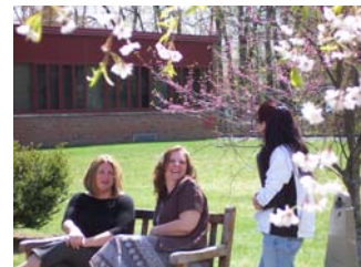
ACC students relaxing outdoors.