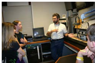
Students take a tour of WACC-Asnuntuck's radio station.