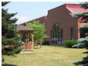
An outside view of the Library Resource Center at ACC.