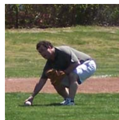
stration fielding the ball.